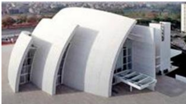
New Jubilee Church (Rome, Italy) made of nano photocatalytic concrete