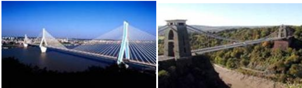
Cable-Stayed and Suspension bridges